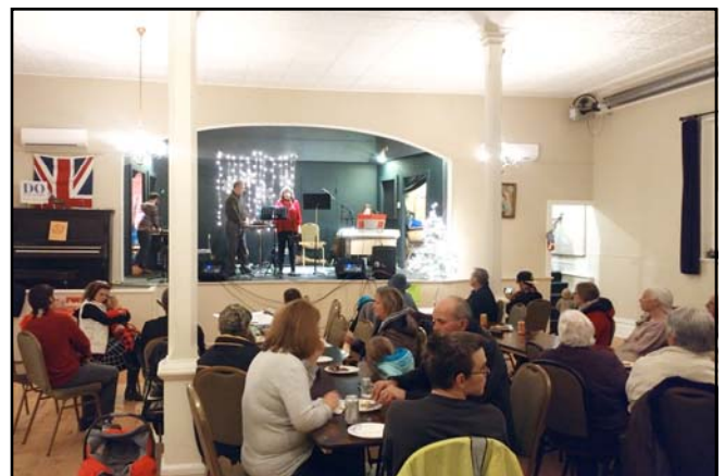
Concert in the Old Town Hall