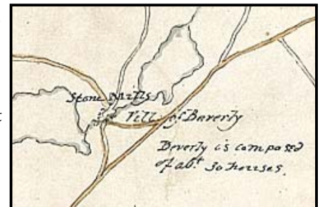
Delta in 1816 and 1828

Top is a section from an 1816 map showing the buildings in Delta. Bottom is a section from a map dated 22 June 1828, showing that the name had changed by this time to Beverley and noting that it consists of about 30 houses. In 1857 the name was again changed, this time to Delta. 1816 map by Joshua Jebb, RE and 1828 map by J. Walpole, RE. Both maps from Library and Archives Canada, NMC 21941 (Jebb) and NMC 11230 (Walpole)