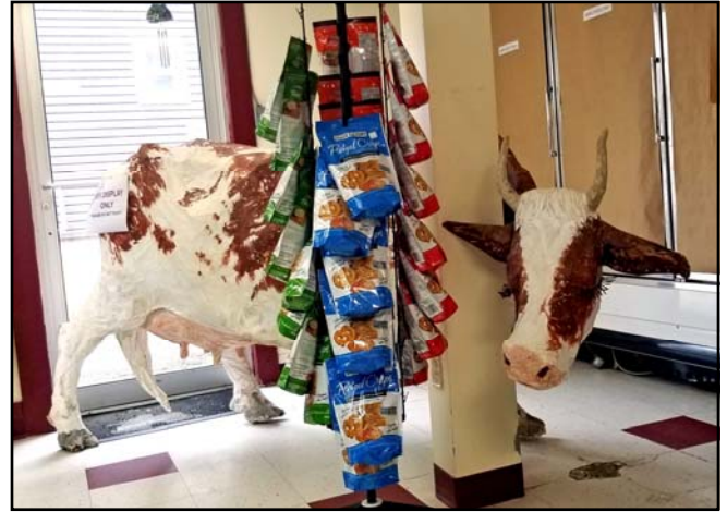
Bossy the Cow now on display at Forfar Dairy