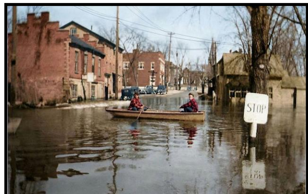
Flood of 1950