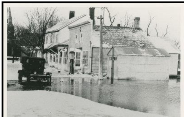
Flood of 1935